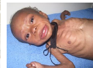
Children in early years

Our recent trip to the UK caused us reflect on how significantly different things are at Morning Star nowadays compared to our traumatic, early years as an organization. Instead of dozens of extremely ill children, many close to death upon admission and dying from the symptoms associated with HIV/AIDS, we now, generally, admit healthy little ones who can enjoy normal childhoods.