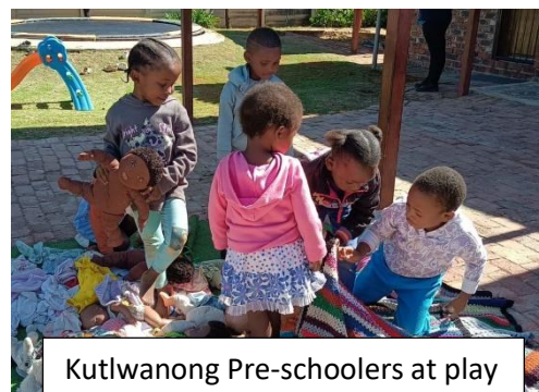
Kutlwanong Pre-schoolers at play

Yes, they still come from impoverished homes and yes, their parents still suffer from the disease themselves but up to 97,5% of babies born to HIV positive mothers nowadays are born free of the disease themselves. We look forward to the day when NO babies are born with HIV/AIDS in South Africa. It's achievable – provided ALL pregnant mothers attend the community clinics, are tested for the disease and whose babies receive anti-retroviral therapy in utero.